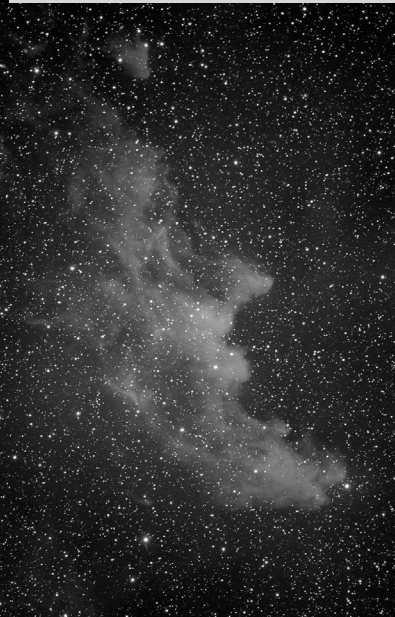
Witch Head Nebula

If you're a reader of the MRO's blog AstroDaily (and if you aren't you should be!) you may have read my recent article on what exactly an equinox is. A very brief summary: an equinox is the time of year when the sun's path is directly above the Earth's celestial equator causing there to be an equal length of night and day everywhere in the world. A solstice is either the longest day of the year or the shortest day of the year depending on if it is the summer or winter solstice.